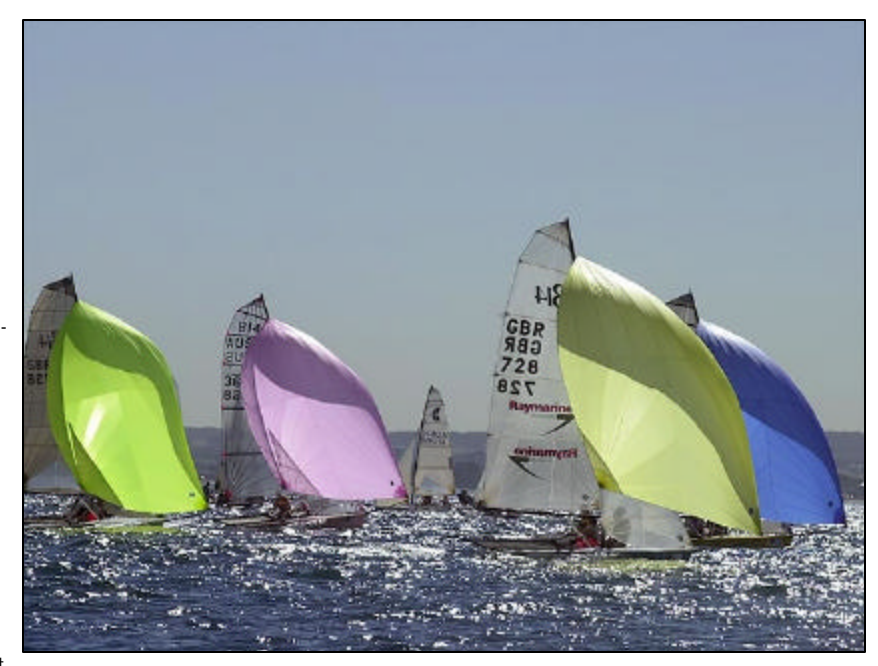
Nils & JB lead the fleet downwind

With two races scheduled for the final day the top four boats were separated by only 4 points. Fells suffered a drama at the start of race 9 when they were hit by a port tack boat placing them near the back of the fleet by the time they had extricated themselves. They kept their cool however to spot some pressure on the right side of the first, light wind, work which eased them up into 10th at the first mark. By utilising the tricky windshifts on the left side up the 2nd work, Fells moved into 2nd place at the end of the race ahead of the Bancroft's who finished 6th after they swam due to a buoy room dispute at the last mark.